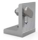
Angle Bracket Assembly